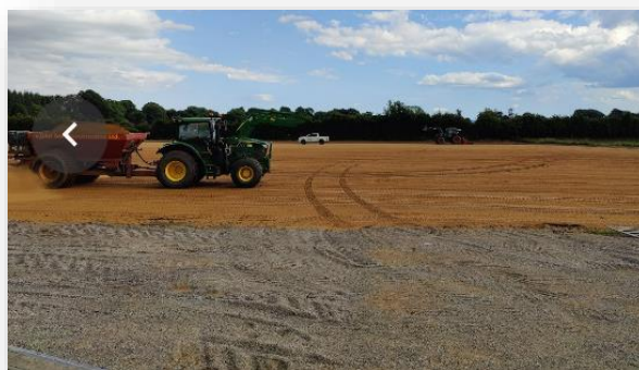
Figure 4 Seed bed preparation by @DARGolf_