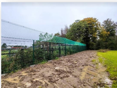
Figure 3 Boundary Fence