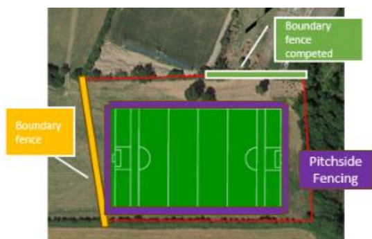
Figure 7 Planned fencing for site

Sports Capital Grants 2024 Application was completed in September. Funding is expected to be available in late Spring/Early Summer 2024. The following items were submitted: