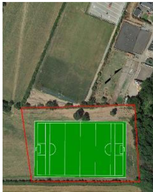
Figure 6 New pitch site location

Focus areas for 2024 for your pitch development team include: