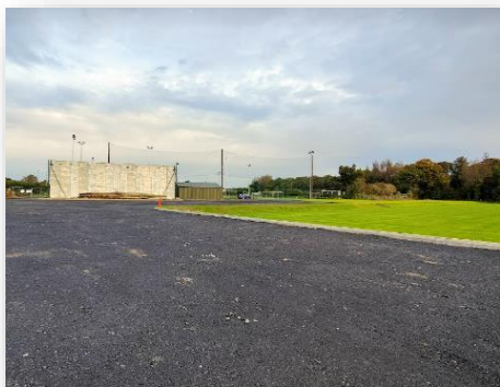
Figure 2 Car Parking Completed