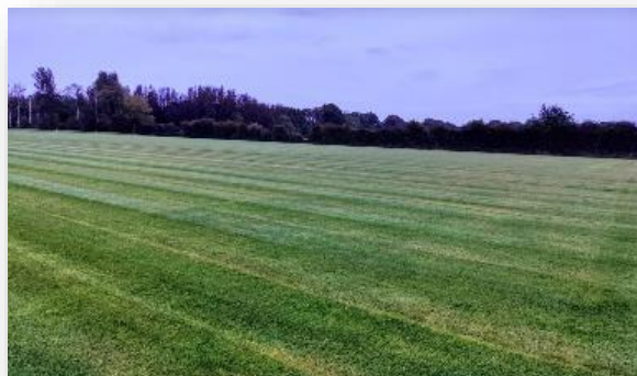
Figure 4 New Pitch Platform